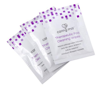
NBE Compare to Caring Mill Therapeutic Antifungal Foot Wipes