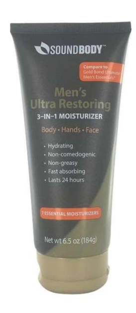
HBF-13 NBE Compare to Gold Bond Ultimate Men's Essentials (6.5oz/184g)