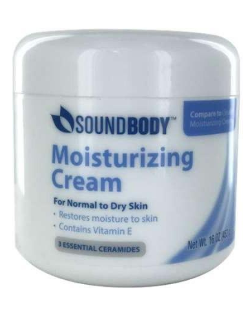
HBF-4 NBE Compare to CeraVe Moisturizing Cream (16 oz/453g)