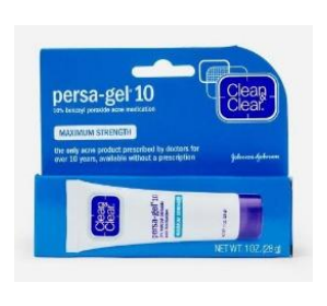
NBE Compare to Clean & Clear Persa-Gel 10 Acne Medication With Benzoyl Peroxide