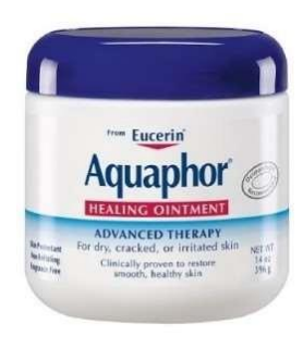
NBE Compare to Aquaphor Healing Ointment Advanced Therapy (14 fl oz/396mL)