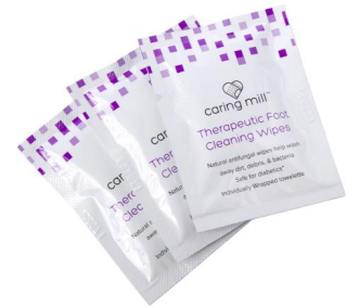
NBE Compare to Caring Mill Therapeutic Antifungal Foot Wipes