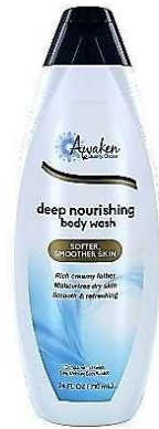
NBE Compare to Dove Deep Moisture Nourishing Body Wash (24 fl oz /710mL)