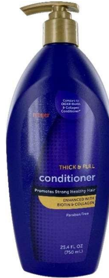
MJ767 NBE Compare to OGX Biotin and Collagen Shampoo (25.4 fl.oz/750mL)