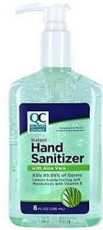
NBE Compare to Purell Instant Hand Sanitizer Aloe Vera (8 fl oz/236mL)