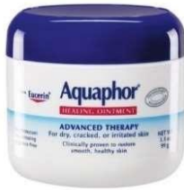
NBE Compare to Aquaphor Healing Ointment Advanced Therapy (3.5 fl oz/99 mL)