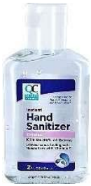
QC99105 NBE Compare to Purell Instant Hand Sanitizer Original (2 fl oz/59mL)