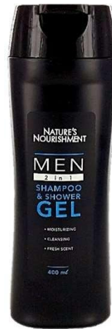
DC889 NBE Compare to Natures Nourishment Men's Shampoo & Shower Gel (13.5 fl. oz/400mL)