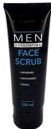
DC639 NBE Compare to Natures Nourishment Men's Face Scrub Cleanses and Refreshes (3.4 fl. oz/100mL)