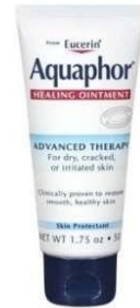
NBE Compare to Aquaphor Healing Ointment Advanced Therapy (1.75 fl oz/50mL)