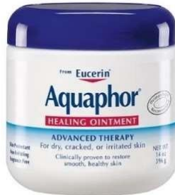
NBE Compare to Aquaphor Healing Ointment Advanced Therapy (14 fl oz/396mL)