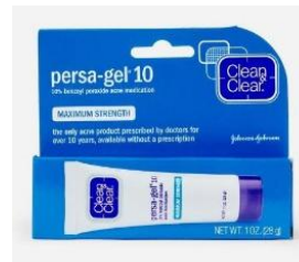
NBE Compare to Clean & Clear Persa-Gel 10 Acne Medication With Benzoyl Peroxide