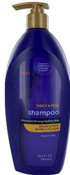
MJ752 NBE Compare to OGX Biotin and Collagen Conditioner (25.4 fl.oz/750mL)