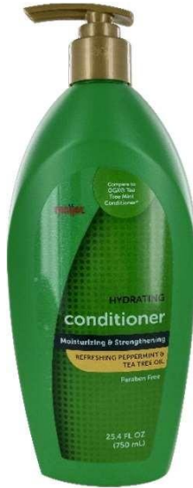
MJ753 NBE Compare to OGX Tea Tree Mint Conditioner (25.4 fl.oz/750mL)