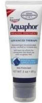
NBE Compare to Aquaphor Healing Ointment Advanced Therapy (3 fl oz/83mL)