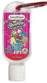
Hand Sanitizer Original Scent (2 fl oz/59 mL)