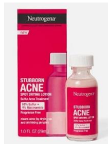
NBE Compare to Neutrogena stubborn acne spot drying lotion - 1 fl oz