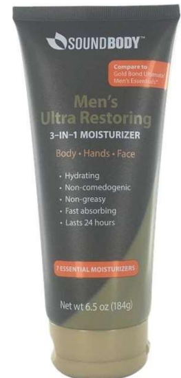
HBF-13 NBE Compare to Gold Bond Ultimate Men's Essentials (6.5oz/184g)