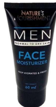
DC886 NBE Compare to Natures Nourishment Men's Normal to Dry Skin (2 fl. oz/60mL)